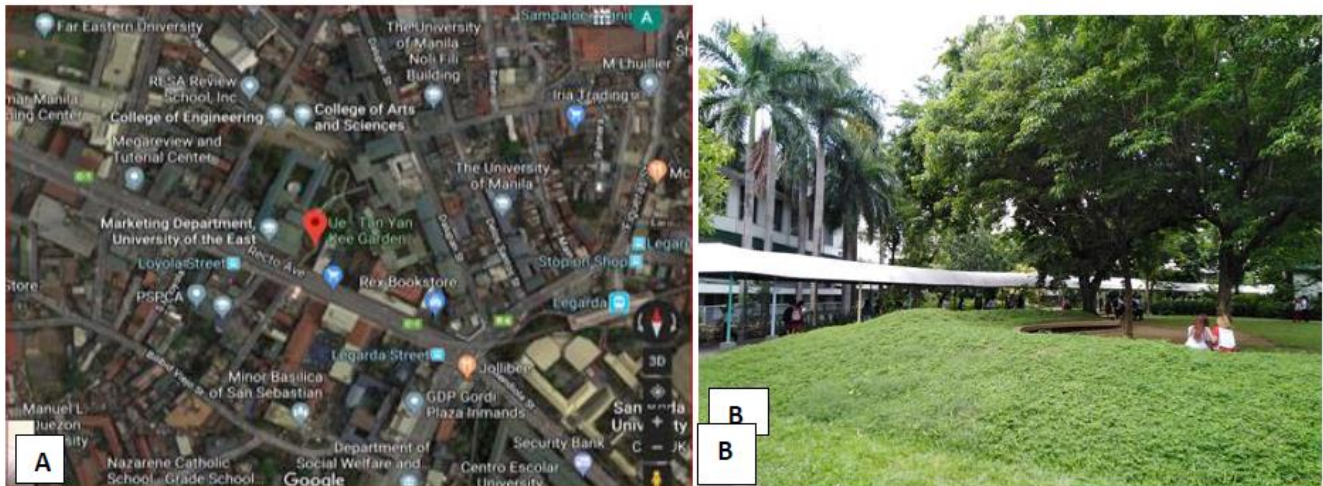
Fig1. (A) google map of the Sampling site with the coordinates of 14°36'7"N 120°59'22"E, Fig 2. (B) the actual sampling site is approximately 2000 Square meters' lot area.

and the rest were set free for ecological conservation of the species.