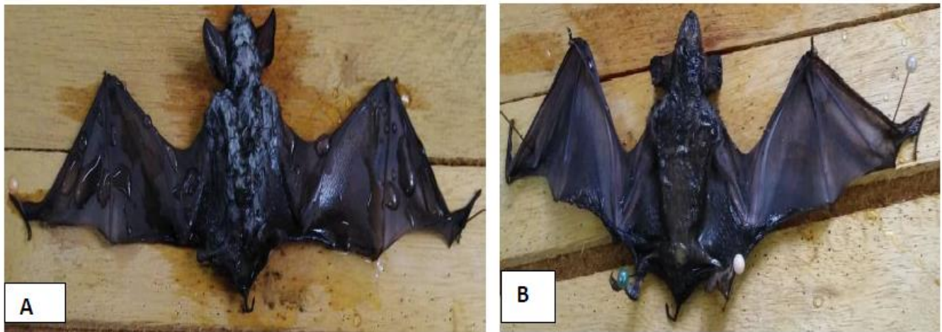
Fig 3. (A) Dorsal view and Fig 4 (B) Ventral view of the Taphozous melanopogon (Emballonusidae). It was collected using an insect net. This species was chasing the flying moth and dragonfly along the Tan Yan Kee garden. It was also spotted roosting in tall tree, on the ceiling of the tall building, rocks crevices side of the building which is under construction inside the campus of UE Manila. Taphozous melanopogon prey on housefly, mosquitoes, dragon fly and ladybird beetle on leaves for food.

Taphozous melanopogon (Emballonusidae) is included in the IUCN red list of threatened species according to (Csorba et al 2008).